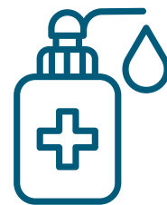
Sanitizer for guests