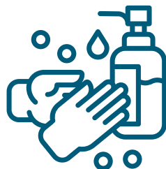
Hand washing every 60 minutes